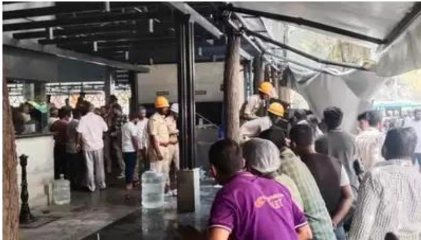
Figure 1: Rameshwaram Cafe After the Blast

The blast is suspected to have been caused by an improvised explosive device (IED) that was left behind in a bag by an unknown person who had bought a token and consumed food at the cafe. The blast injured nine people, including two staff members and seven customers, one of whom sustained 40 percent burns. The injured were taken to nearby hospitals for treatment.